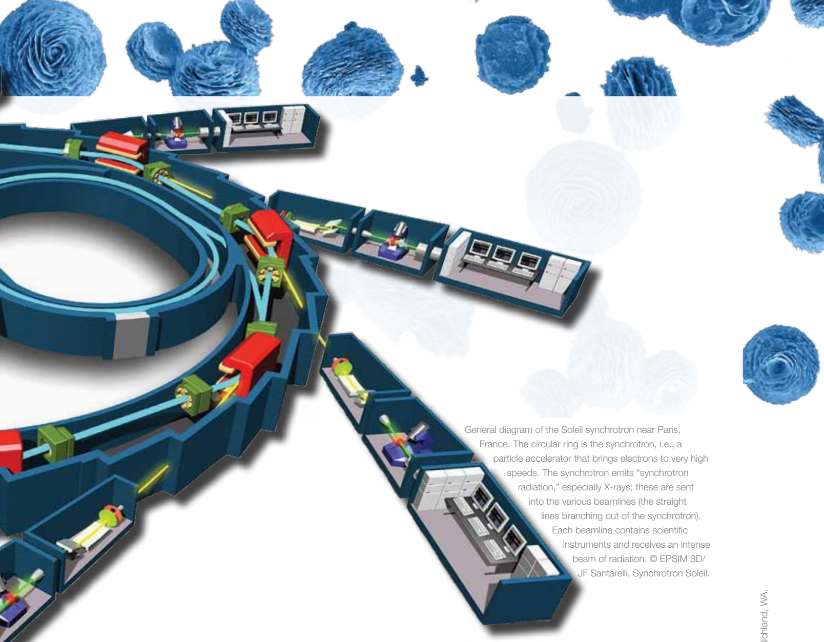
General diagram of the Soleil synchrotron near Paris, France. The circular ring is the synchrotron, i.e., a particle accelerator that brings electrons to very high speeds. The synchrotron emits "synchrotron radiation," especially X-rays; these are sent into the various beamlines (the straight lines branching out of the synchrotron). Each beamline contains scientific instruments and receives an intense beam of radiation. © EPSIM 3D/JF Santarelli, Synchrotron Soleil.